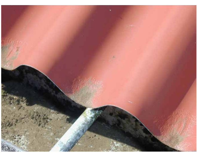
Silt accumulation on a panel without a drip edge. Blistering of the paint is an early sign of corrosion.

Our field inspections conducted to date indicate that panel design may play a significant role in the rate of corrosion due to acid rainfall and VOG from the volcano. Panels with an exposed cut edge and corrugated profile tend to hold small amounts of water and debris at the very edge due to capillary